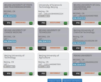
194 search results for Beijing university

As mentioned above, a further complementary survey specifically on recognition will be sent to the student after the mobility period to assess the quality of the recognition provided.